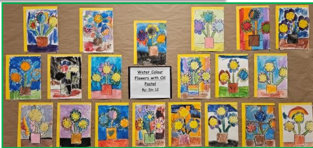
Division 12 Water Colour Flowers with Oil Pastel