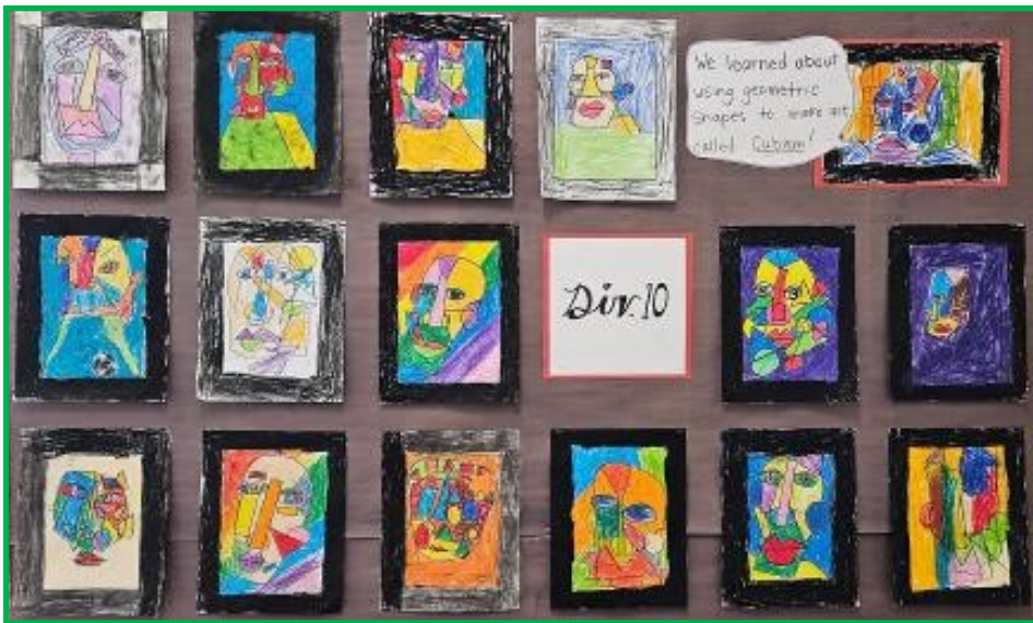
Division 10 learned about using geometric shapes to make art called Cubism!