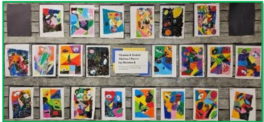
Picasso & Cubist Abstract Faces By Division 8