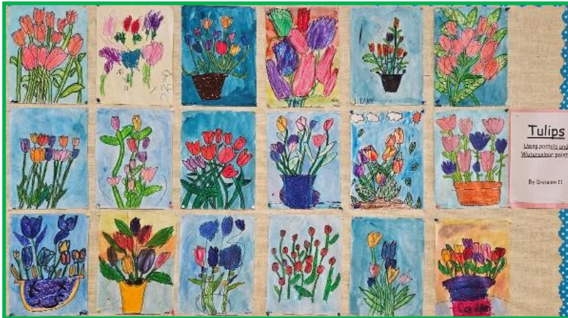
Tulips using Pastels and Water-Colour Paints by Division 11