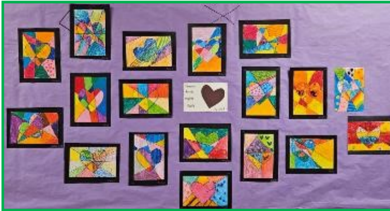
Romero Britto Inspired Hearts by Division 9