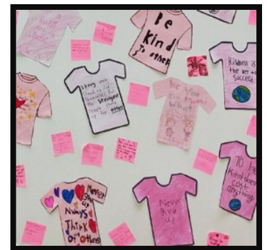
Mall Display by Students at Burnaby Mountain Secondary, Cameron, Lyndhurst, and Stoney Creek Elementary schools